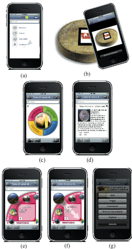
Figure 1. Example of the wheel on an iPhone

Interacting with the object and its world: The wheel. Once a contact with an object has been established, the user can interact with it and access its social network. Since we aimed at using objects as gateways for accessing the cultural heritage of a territory, we designed an intelligent interaction model that allows users to explore the world starting from a contacted object. We developed a “wheel” model (Fig. 1(c)), where the wheel can be seen as the square of a village, the traditional place for meeting; in this place the user can interact with the object and its friends, exchanging information and knowledge, being introduced to and exploring their social networks. The object the user is interacting with is in the center of the wheel. The user can get in touch with it by simply touching it, which is an appealing and natural way of performing selective actions with a touch sensitive interface. The selected object tells the user about itself, providing both general knowledge and information synthesized from the interaction with other people (including tags, comments, ratings) (Figure 1(d)). The user can, in turn, tell something to the object: in particular, she can add her tags, comments and ratings or can bookmark the object (Figure 1(g)). These actions contribute to (i) adding the information to the object in focus and (ii) influencing the social relations between objects, as discussed in the following.